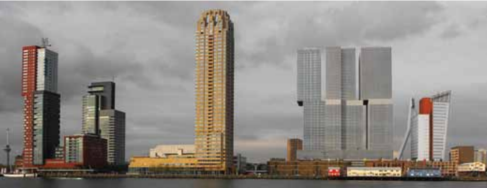
Figure 14. The Wilhelminapier skyscrapers (L to R): Montevideo, World Port Center, New Orleans, de Rotterdam, and KPN Tower.

spaces and functions within. In this way, the iconic De Rotterdam is designed to orient both inwards, attracting users of the building, and also outwards, through its domination over the overall city image. However, its contribution to the surrounding urban open spaces doesn't seem to be significant, instead serving to underscore the main role of the whole Wilhelminapier ensemble as a tool for image-making, branding and marketing.