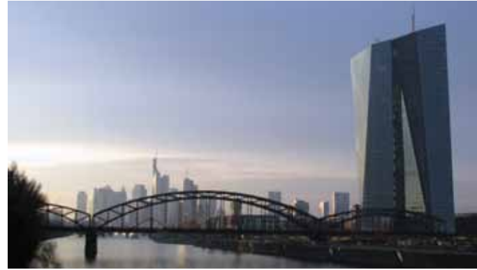
Figure 9. View of Frankfurt's skyline from the Ostend district, with the new ECB Tower.

Planning for the introduction of new skyscrapers into the existing metropolitan setting, as well as their architectural formulation, are just a few of many activities impacting further development of Frankfurt's image. There are many manifestations that are utilizing the attractiveness of the skyline for cultural production, such as the "SkyArena", which promotes the skyline of Frankfurt by treating the façades of the skyscrapers as a huge projection screen; and the Das Wolkenkratzfestival (Skyscraper Festival), which attracts many admirers of skyscrapers by opening them to the public and turning them into cultural event venues. Planning for the overall visual representation therefore plays an equally important role in drawing international attention and its promotion as an asset of the city. Through integrated concepts like overall illumination, Frankfurt also uses its skyline as a fine-tuning mechanism for projecting its metropolitan image of success.