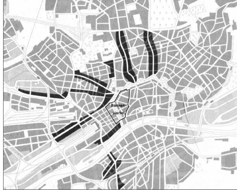
Figure 2. Fingerplan (1968) with Bankenviertel (framed in black) and zones for densification (shaded areas).

Along with the rise of the Postmodern style in architecture, the third generation of