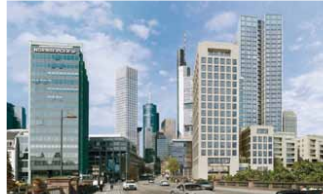
Figure 6. Panorama Tower – Maintor, Frankfurt (right) with the Schweizer National (left) on the opposite.

urban fabric. Its principle of keeping the skyscrapers within groups or clusters produced an ensemble effect, such that grouping skyscraper silhouettes would produce a high-quality skyline that would foster the image of the whole city.