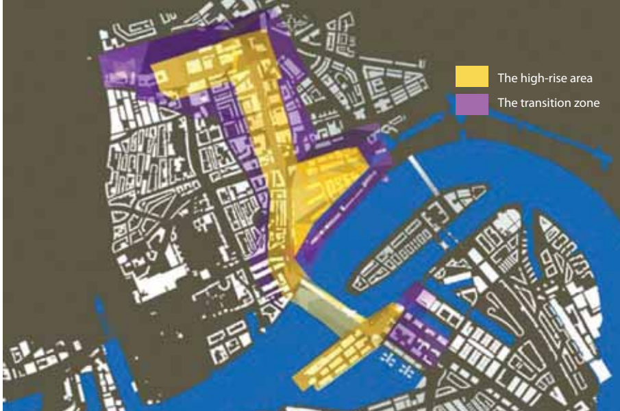
Figure 10. "Nutshell" high-rise area. © City of Rotterdam. Source: Binnenstad as Citylounge, Oct. 2008.

hand, there are also special restrictions on the skyline, related to the volume of the high-rise in relation to plot size, its visual quality, its effects on urban microclimate and limitations of heights within clusters (Gemeente Rotterdam 2008).