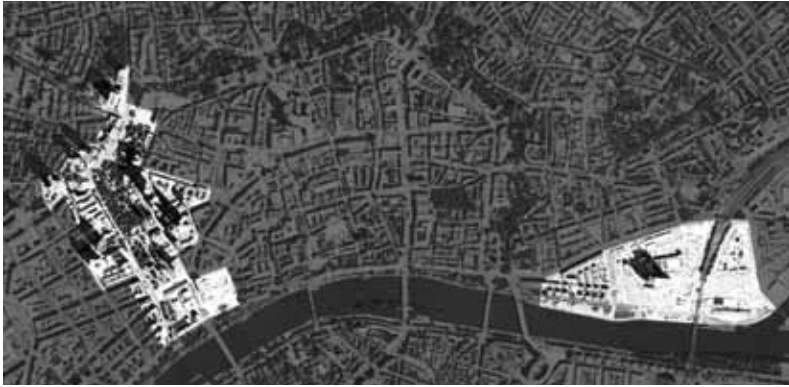
Figure 8. Developing areas in Frankfurt – financial district (left) and Ostend riverfront (right).

along Neue Mainzer Street, the introduction of housing in the financial district, and the opening of access to the public, with the introduction of a new museum of modern art (MMK 2) on its ground floor. As a concession of the planning authority to ensure the inclusion of residential facilities in a separate building, the office tower was allowed to be even higher than planned and finally reached 170 meters instead of the originally planned 135 meters, thereby significantly contributing to the overall appearance of the skyline.