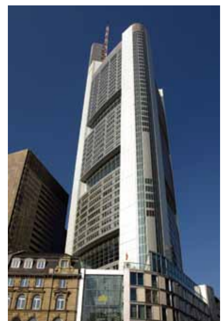
Figure 4. Commerzbank Tower, Frankfurt.

Development of the booming skyline was regulated by the High-Rise Development Plan of 1999, which took into consideration the experiences of some other important global cities, such as Paris and London, as well as of Berlin, Munich, Vienna, and Boston, and presented an urban design vision for the implementation of high-rise buildings into the