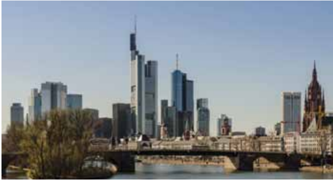
Figure 1. View of Frankfurt's financial district.

one hand, these structures are the modern successors to the fortifications that used to gird the same area in medieval times. On the other hand, its spatial structure, with high-rises organized around a central green area, bears a strong resemblance to the skyscrapers surrounding Central Park in New York, if at a far smaller scale.