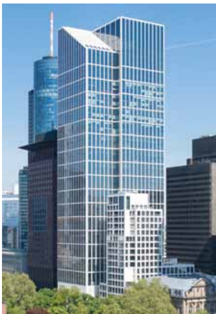
Figure 7. TaunusTurm Tower, Frankfurt.

However, despite establishing a stable planning policy for the further shaping of the skyline, development has significantly slowed since 2000. The skyscrapers constructed after this year were characterized mostly by clear, plain geometrical forms, with the domination of non-transparent glass as a façade material, as seen in Maintower (2000), Westhafen Tower (2003), and Skyper (2004). Such minimalistic design could have heralded a gradual transition from the third to the fourth