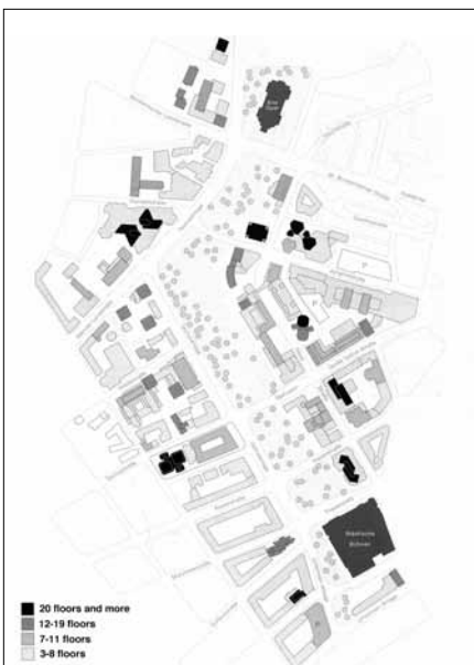
Figure 3. Bankenplan/Clusterplan used by the City Planning Office until 1984.

The historical conditions of the development of Frankfurt's skyline were arranged after the city was passed over as the site of the postwar federal capital. Its new economic strategy was based on its long tradition in trade, banking, and industry, with the intention of becoming at least the economic capital of the country, if not of Europe. For this reason, the city