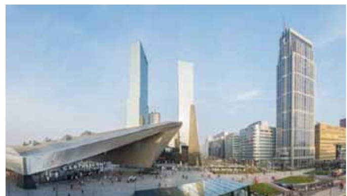
Figure 12. Millennium Tower, Rotterdam near Central Station.