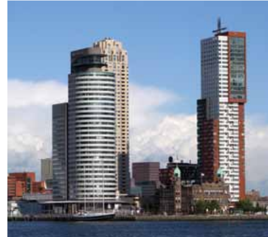
Figure 13. Wilhelminapier’s front: World Port Center (left) and Montevideo (right) skyscrapers, with Hotel New York in between.

Although much smaller in size, the developing high-rise cluster on Wilhelminapier still carries utmost significance for the overall city image. The last skyscrapers constructed on the