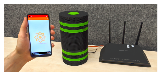
Figure 1: The user can securely setup a smart speaker. The pairing process involves an acoustic out-of-band channel to protect the integrity of the main channel.

This work is licensed under a Creative Commons Attribution 4.0 International License.