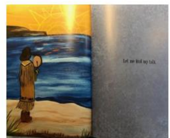
Fig. 4: I Lost My Talk (Joe 2019: unnumbered)