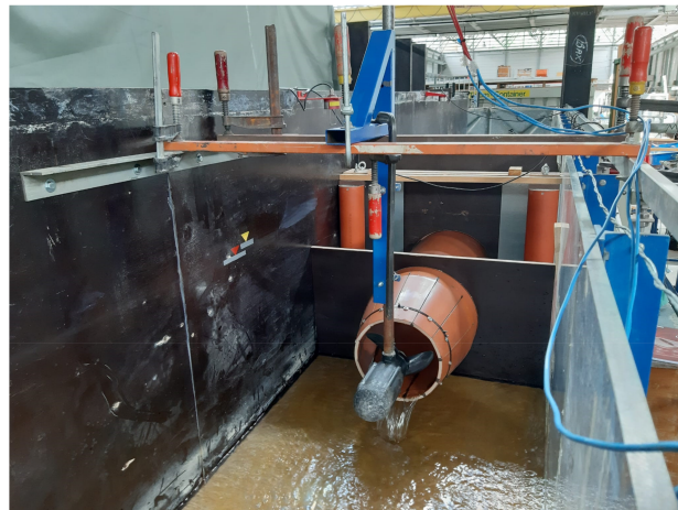
Figure 3. Flume investigation of pico-turbine performance in the Hydraulics Lab at TU Darmstadt.

Based on the doctoral research findings of pico-turbine laboratory investigations, the setup generated between 40–60 W of power, which is sufficient enough to light a house bulb and charge a mobile phone [12]. It was shown that the use of e-waste is technically feasible for use in this research focus. Further field trial tests for a small hydrokinetic turbine are planned based on the laboratory investigation at TU Darmstadt. A transfer into practice through a field test facility in Kenya is planned. Further investigation into the drive potential of turbines with electrical or mechanical energy transmission for small plants and equipment is required to substantiate the application possibilities and limits of small turbines.