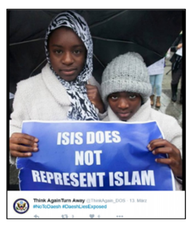
Figure 4: Picture campaign by @ThinkAgain_DOS.

ture remains uncommented; it was only equipped with the hashtags #NoToDaesh and #DaeshLiesExposed. The two women stand symbolically for all modern Muslim women who do not support the ISIS and who do not let themselves be discriminated.