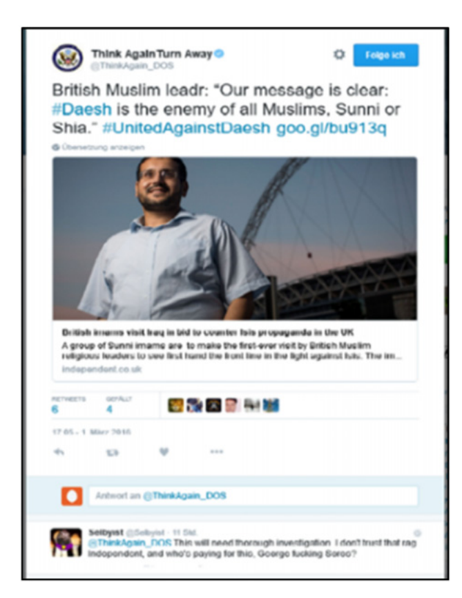
Figure 1: Tweet from @ThinkAgain_DOS.