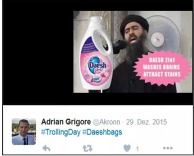
Figure 9: #TrollingDay Abu Bakr al-Baghdadi with detergents.

bag is inspired by the word "douchebag", which colloquially means sucker. With the advertisement of detergent, the IS is - literally - portrayed effeminately. The brainwash, which happens through propaganda and recruitment, turns the supporter to marionettes of the IS, individual opinions are rejected, says the intension of the antipropaganda.