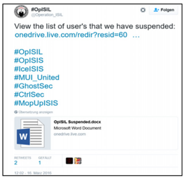
Figure 14: Tweet from @Operation_ISIL.

have been disarmed. Figure 15 illustrates that there is a possibility for everyone to join the war against extremist groups. For this, all users are asked under appropriate instructions to report conspicuous accounts. Other activities are kept hidden from the social network since it involves illegal activities, which are not intended for the public. The success of these hacker attacks remains questionably as numerous sites are callable despite many barriers. Hackers can also be 'haunted' by ISIS users. They fight among each other and simultaneously call for a hunt. In the post from 18<sup>th</sup> March 2016, @intel_ghost draws attention to a