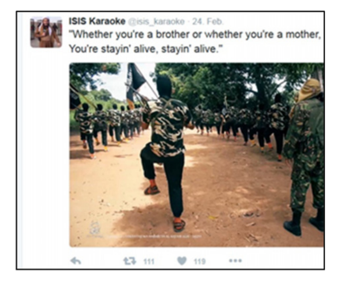
Figure 13: @isis_karaoke IS fighters dance presumably with "Stayin' alive".

have been disarmed. Figure 15 illustrates that there is a possibility for everyone to join the war against extremist groups. For this, all users are asked under appropriate instructions to report conspicuous accounts. Other activities are kept hidden from the social network since it involves illegal activities, which are not intended for the public. The success of these hacker attacks remains questionably as numerous sites are callable despite many barriers. Hackers can also be 'haunted' by ISIS users. They fight among each other and simultaneously call for a hunt. In the post from 18<sup>th</sup> March 2016, @intel_ghost draws attention to a