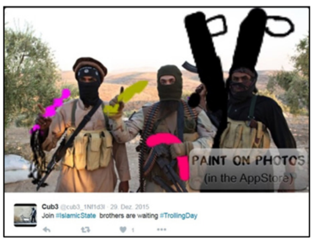
Figure 8: #TrollingDay IS fighters with dildos.

Another topic of various tweets of the Trolling Days is the lack of intelligence of the IS. The displayed post, for example, shows the ISIS leader Abu Bakr al-Baghdadi with the detergent Daesh (Figure 9). The hashtag #Daesh-