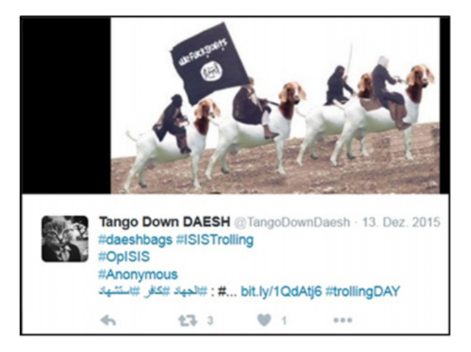
Figure 7: #TrollingDay IS fighters with goats.

der penalty of death. In December 2015, a video was released which showed how two homosexual men were captivated and thrown off a roof. ISIS is virtually hunting homosexuals, even more abusive is the description 'gay' for them. In Figure 8, one can see armed IS fighters, whose weapons are turned into oversized dildos. The user tweets below: "Join #IslamicState brothers are waiting #Trolling-Day." This implicates that the ISIS were a 'gay club', which hurts their dignity. In further pictures IS fighters are shown in lady's underwear swinging the 'Gay Pride'-Rainbow-Banner. Also, the hint on the virgins was picked up again by a Meme which tells: "Promise 72 Virgins. Doesn't mention Gender."