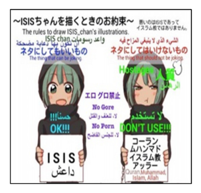
Figure 10: Guidelines for ISIS Chan.

should fill the results of the image search on "ISIS" with presentations of the anime girl. In the first 24 hours, the hashtags were used 9.000 times on Twitter (ibid.). Figure 11 shows ISIS Chan with a melon on a plate. She holds the knife wrongly at her throat. The subscriber explained that she wanted to teach the ISIS what knives are actually for: cutting melons.<sup>1</sup>