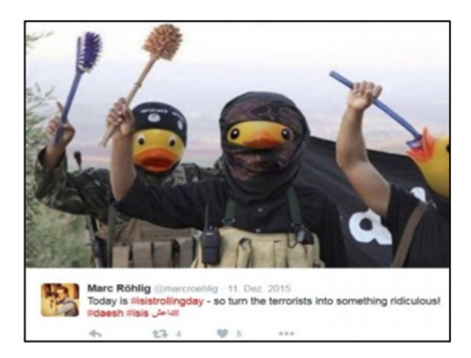
Figure 6: #TrollingDay IS fighters as bath ducks.