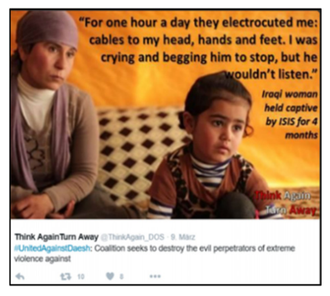
Figure 3: Picture campaign by @ThinkAgain_DOS.

aim is to strengthen the accusations against the ISIS to be violent and ruthless.