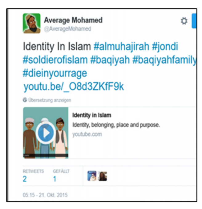
Figure 5: Tweet by @AverageMohamed.

Parody is a hilarious satirical imitation by distortion and exaggeration. The satire is a genre, which criticizes and