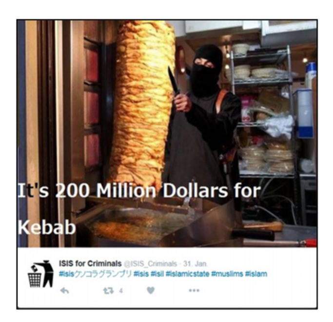
Figure 12: #ISISCrappyCollageGrandPrix IS fighter with kebab.