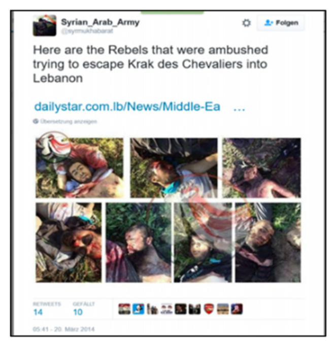
Figure 2: Tweet from @syrmukhabarat.

Besides the news articles, @ThinkAgain_DOS also posts pictures or videos, which are supposed to communicate educational messages. Under #UnitedAgainstDaesh a picture (Figure 3, 09.03.2016) was posted, which shows an Iraqi woman and a girl, who sit on a couch side by side and look seriously: "'For one hour a day they electrocuted me: cables to my head, hands and feet. I was crying and begging him to stop, but he wouldn't listen.' Iraqi woman held captive by ISIS for 4 months." The comment on the picture says: "#UnitedAgainstDaesh: Coalition seeks to destroy the evil perpetrators of extreme violence against". The post's