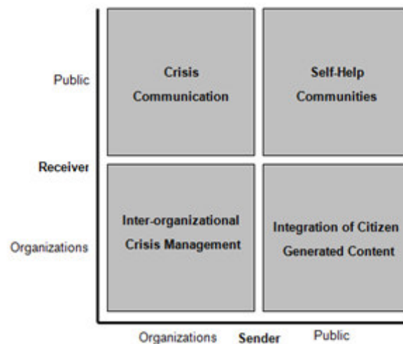
Figure 2: Communication Matrix for Social Software in Crisis Management (Reuter et al. 2011)

Emergent Groups - which correspond to the term ‘Self-Help Communities’ (Figure 2) - represent communication relationships between private citizens who are not part of the official crisis management’s organizations.