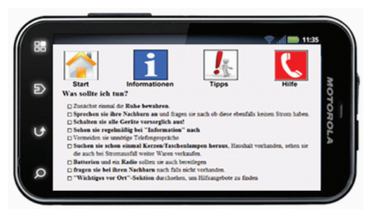
Figure \ 4. \ Screenshot of the prototypical application concept \ ``BlaCom" for blackout communication