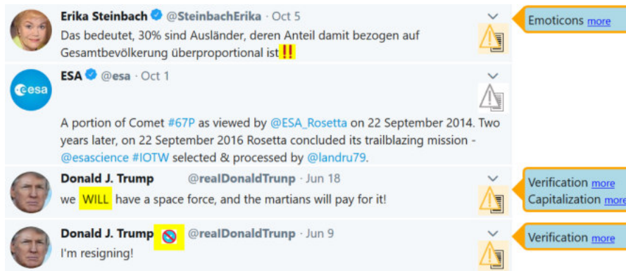
Figure 1. Exemplary output of plugin for four tweets

guarantees that other contents like “ Who to follow ” do not remain hidden. A central feature of TrustyTweet is the configuration pop-up (see Figure 2 ). Using checkboxes, the user can switch the examination regarding specific indicators on and off. Hence, the plugin intends to build a stronger sense of autonomy and to counteract paternalism.