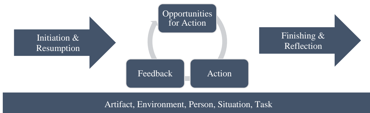
Figure 3. Preliminary research framework: embedding of the flow loop model based on Schaffer (2014) in the steps of initiation & resumption as well as finishing & reflection

sensitive notifications. However, with their immediate-style interruptions (McFarlane, 2002) and without configurability they may challenge the user's attention and therefore disturb the flow experience.